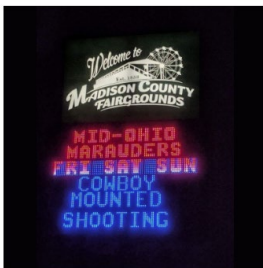
Coughlin Arena, Madison Co Fairgrounds, London, OH